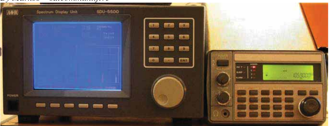
The finished mod showing the broadcast band 9Mhz span